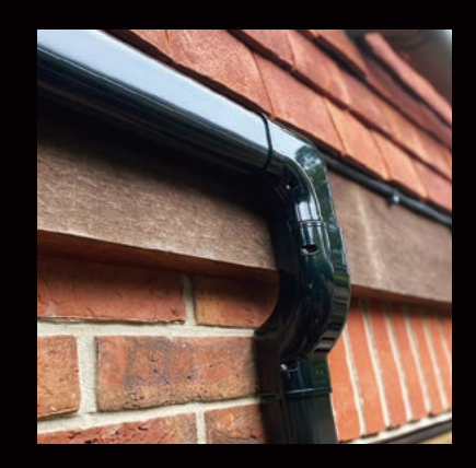
Temp Technical (UK)