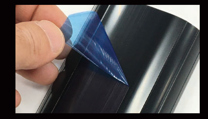
Film protects surface of straight trunking from any scratches or damages before using.