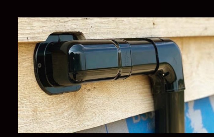
Surface of SLIMDUCT Black is so shinny and brilliant, even after several years, it can keep beautiful surface just by wiping it.