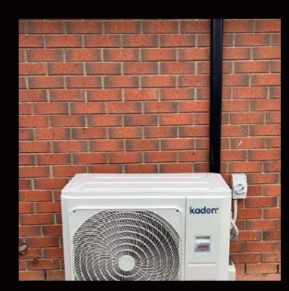
Tempo Aircon (Australia)