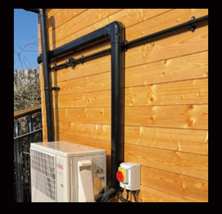
Temp Technical (UK)