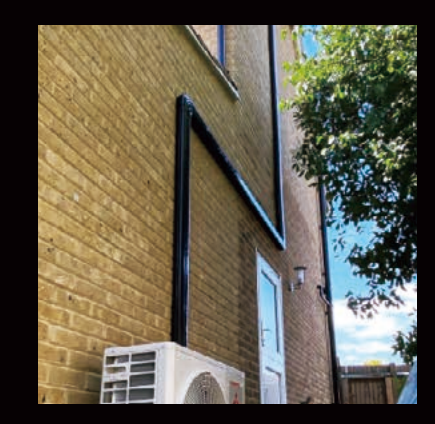
Temp Technical (UK)