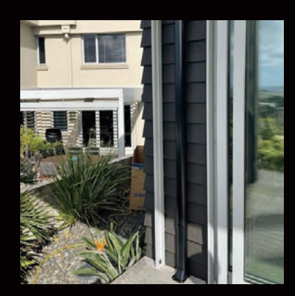
Cool Wave (New Zealand)